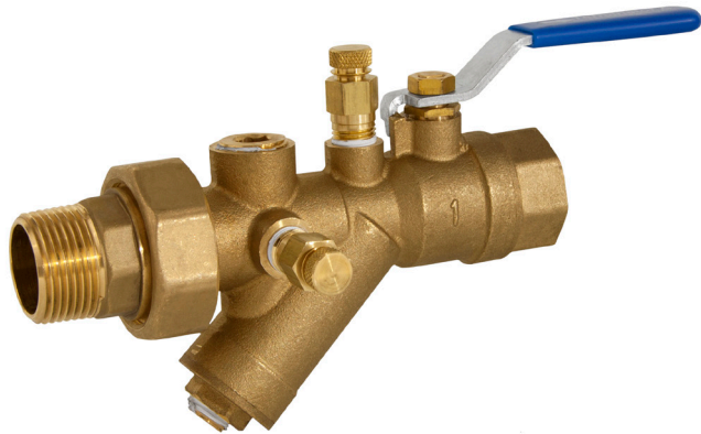
Terminator A SS

Automatic Flow Limiter • Isolation Ball Valve • Union • 600 WOG • with Stainless Steel Trim