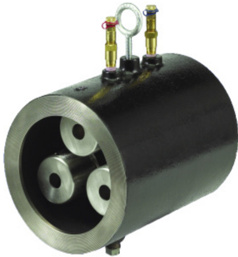
Terminator A Wafer x Wafer

Automatic Flow Limiter • Wafer Connection • 400 WOG